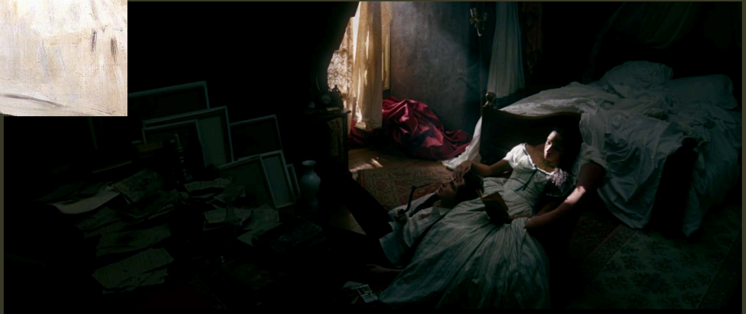
A still from Jeanne

We wanted to infuse painting and poetry at the core of our film. The beauty of these three mediums combined underscores the theme of Jeanne's "gilded cage." She is immortalized through art, but erased in life.