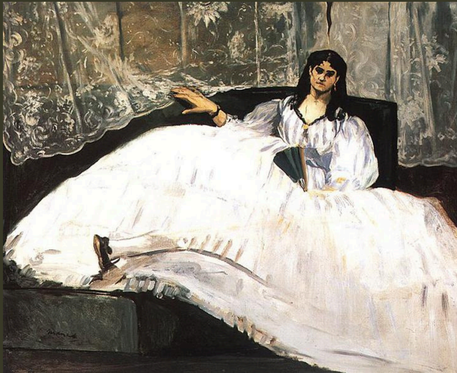
Baudelaire's Mistress by Edouard Manet

We wanted to infuse painting and poetry at the core of our film. The beauty of these three mediums combined underscores the theme of Jeanne's "gilded cage." She is immortalized through art, but erased in life.